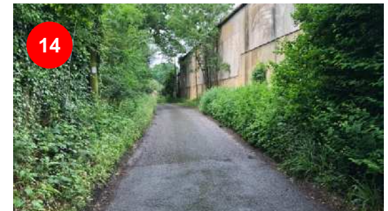
Introducing Passing Bays