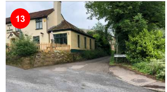
Junction Improvements to A281